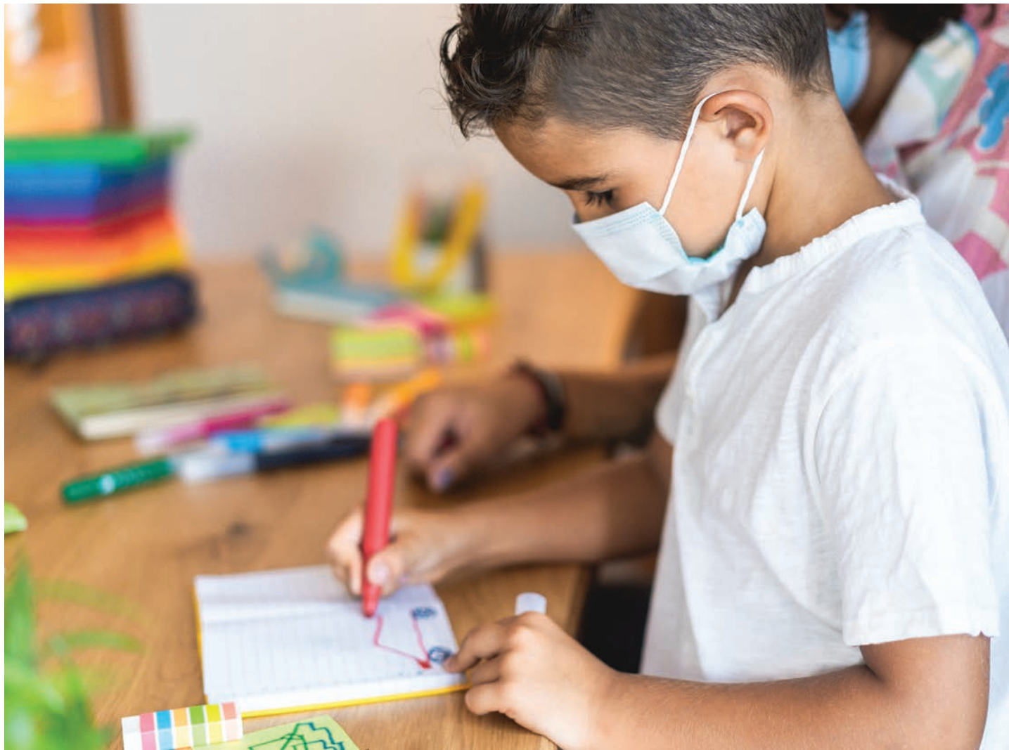
Stock photos of students back in the classrooms