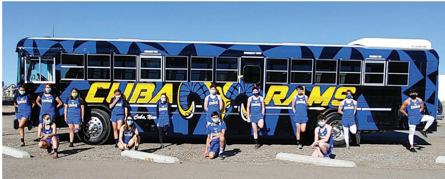
Cuba High School Cross-Country team were the first ones to use the brand-new Cuba Rams Bus Feb. 7 when they traveled to the Bosque School's Cross Country Invitational.

"They're running a cross-country race almost a year later and it was just really cool and emotional for those kids to get out there and be able to compete, not only as individuals but as a team and represent their family, their community and Cuba Schools," Hatch said. "It was just good to see those kids get out there and run."